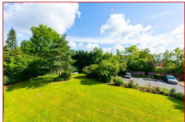
view from bedroom