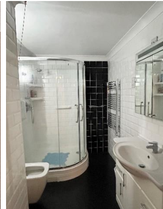
Please note: Some furniture items have been removed from the property