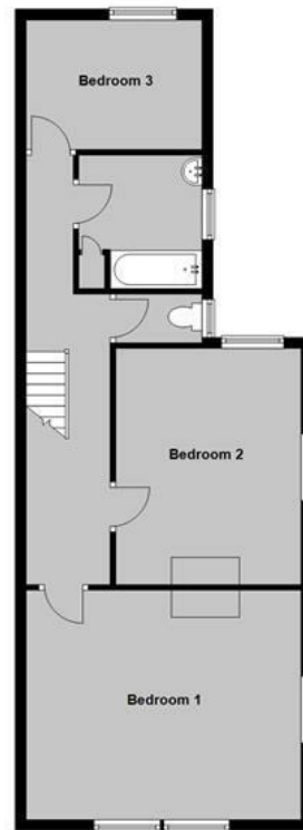
Main area: Approx. 140.9 sq. metres (1516.8 sq. feet) Plus garages, approx. 31.3 sq. metres (336.6 sq. feet)