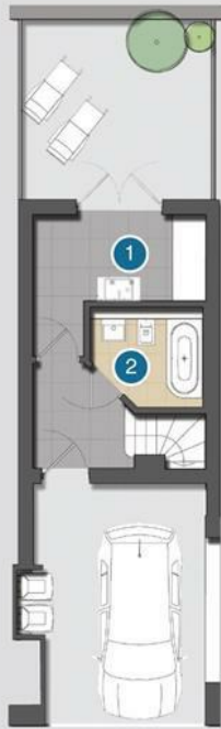
GROUND FLOOR Area 19.45m 2 (209.36 ft 2 )