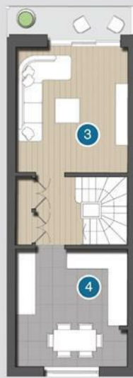
FIRST FLOOR Area 37.7m 2 (405.80 ft 2 )