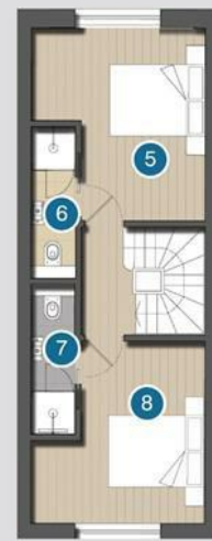
SECOND FLOOR Area 37.7m 2 (405.80 ft 2 )