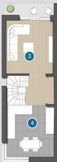
FIRST FLOOR Area 37.7m 2 (405.80 ft 2 )