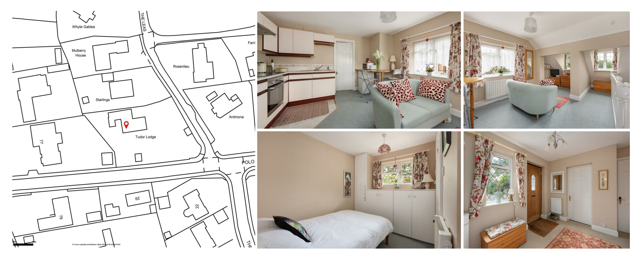
Viewing: STRICTLY BY APPOINTMENT WITH CHRISTOPHER HODGSON ESTATE AGENTS

95-97 TANKERTON ROAD, WHITSTABLE CT5 2AJ | 01227 266 441 | INFO@CHRISTOPHERHODGSON.CO.UK | CHRISTOPHERHODGSON.CO.UK