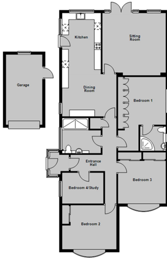
Main area: Approx. 128.3 sq. metres (1381.5 sq. feet) Plus garages approx. 14.6 sq. metres (157 sq. feet) Plus outbuildings approx. 40.7 sq. metres (438.4 sq. feet)