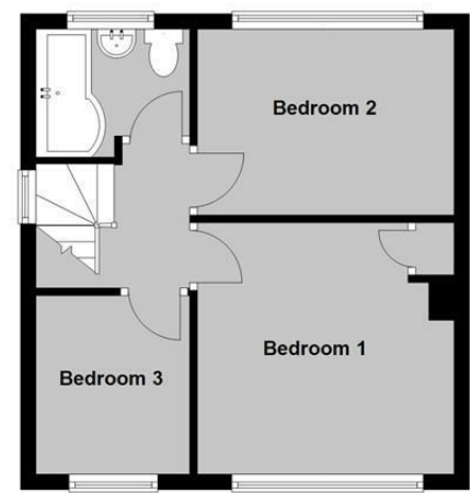
Main area: Approx. 65.6 sq. metres (706.6 sq. feet) Plus outbuildings, approx. 12.6 sq. metres (135.7 sq. feet)