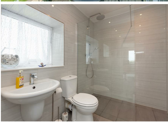
Viewing: STRICTLY BY APPOINTMENT WITH CHRISTOPHER HODGSON ESTATE AGENTS

95-97 TANKERTON ROAD, WHITSTABLE CT5 2AJ | 01227 266 441 | INFO@CHRISTOPHERHODGSON.CO.UK | CHRISTOPHERHODGSON.CO.UK