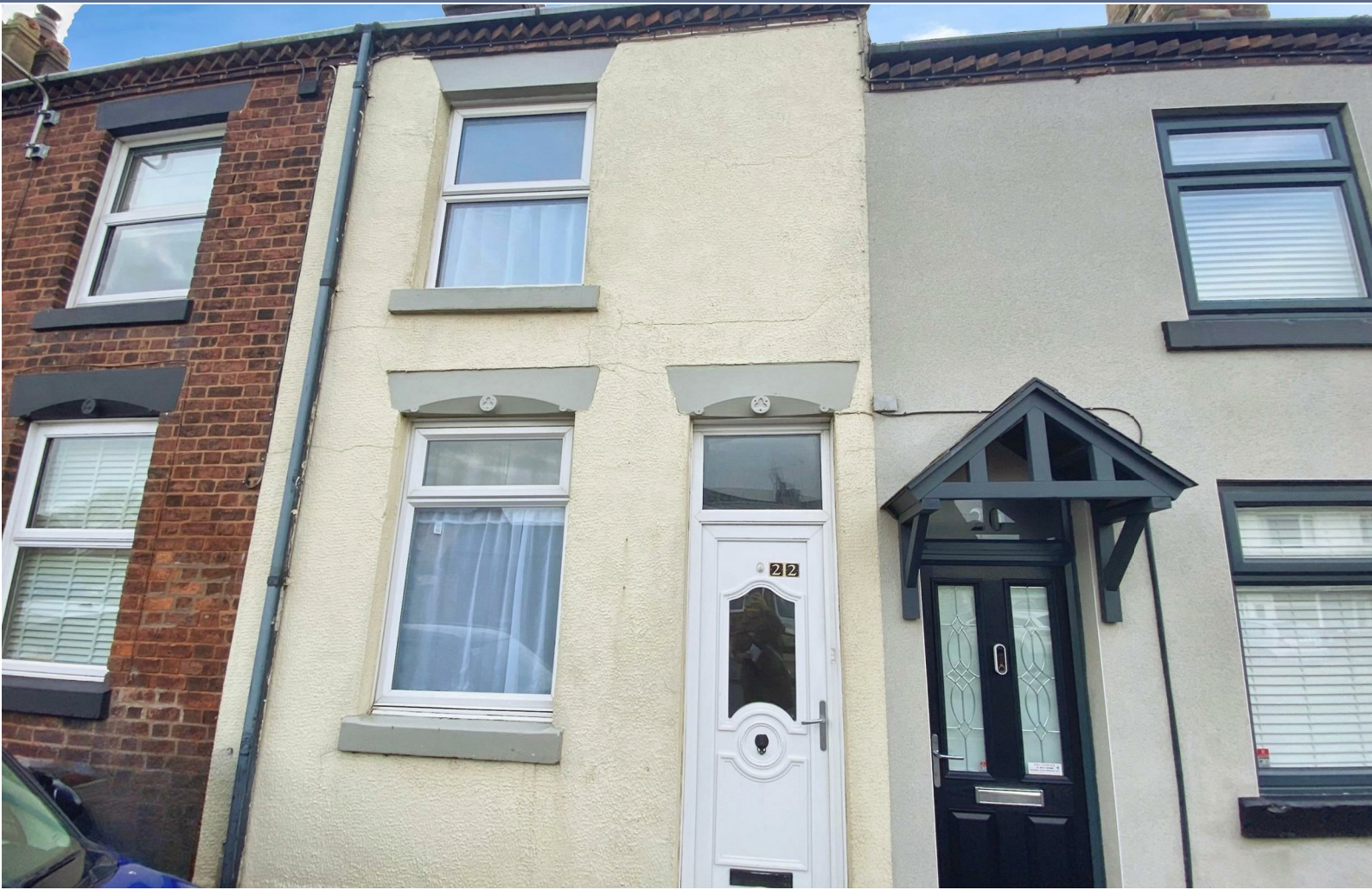
The Bank Stoke-On-Trent