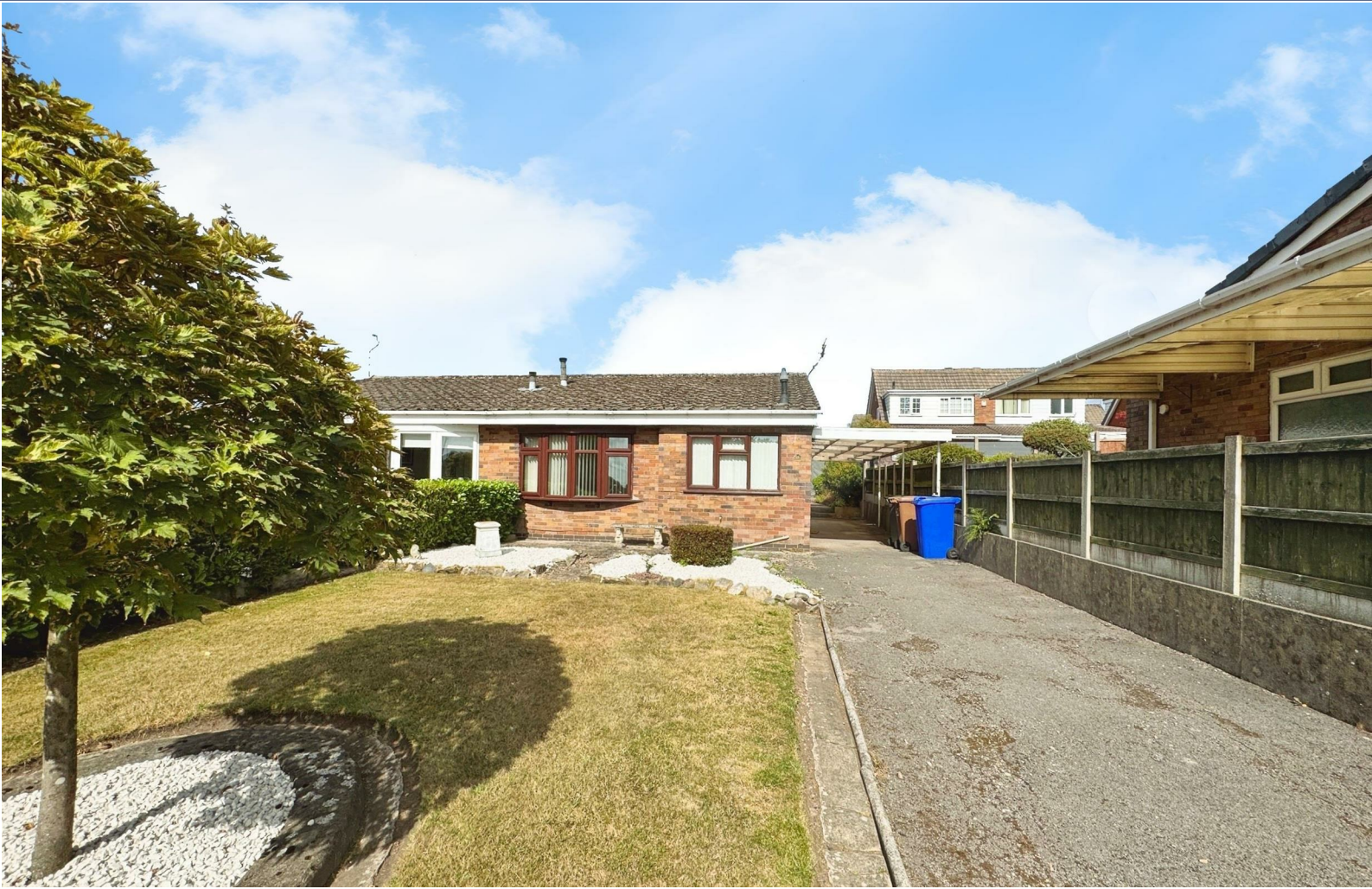
Heathside Lane Stoke-On-Trent