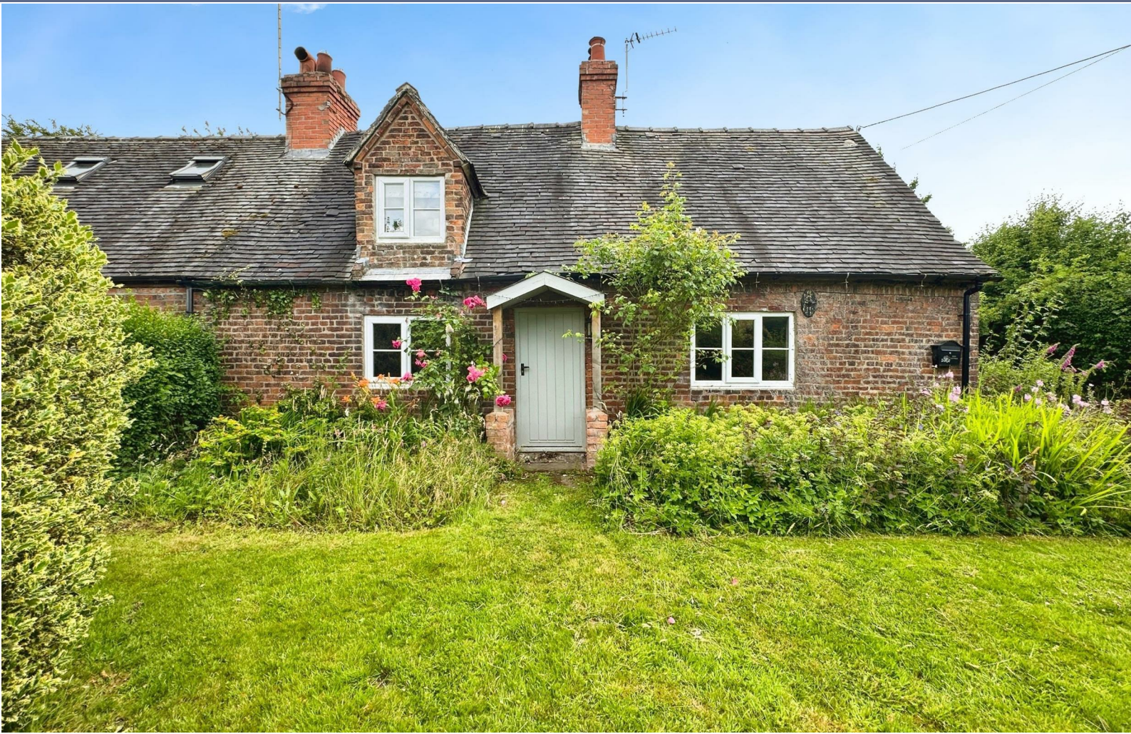
Townsend Lane Stoke on Trent