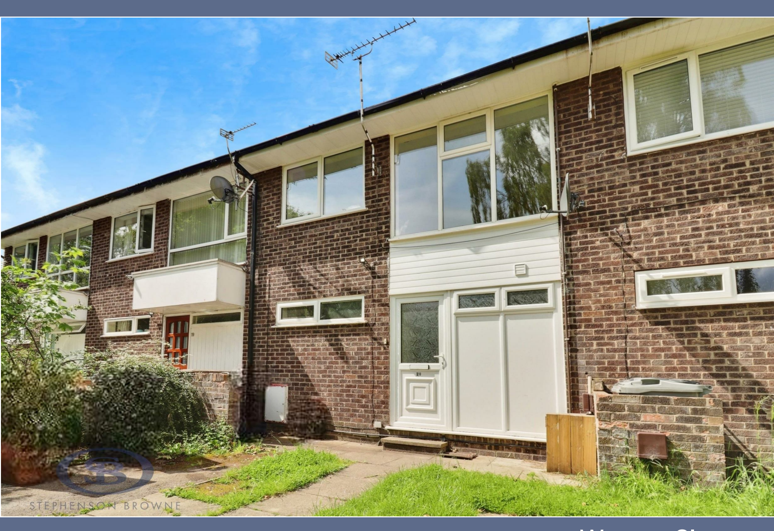
Weaver Close Stoke- On- Trent