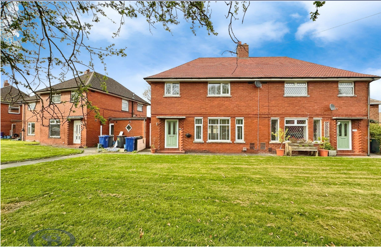
Cedar Avenue Stoke-On-Trent