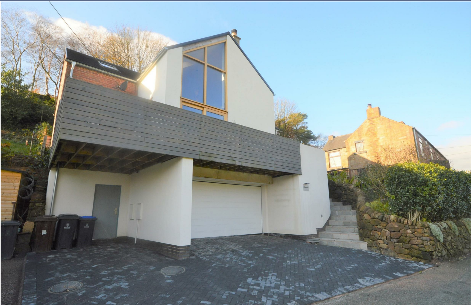
St Annes Vale Stoke On Trent