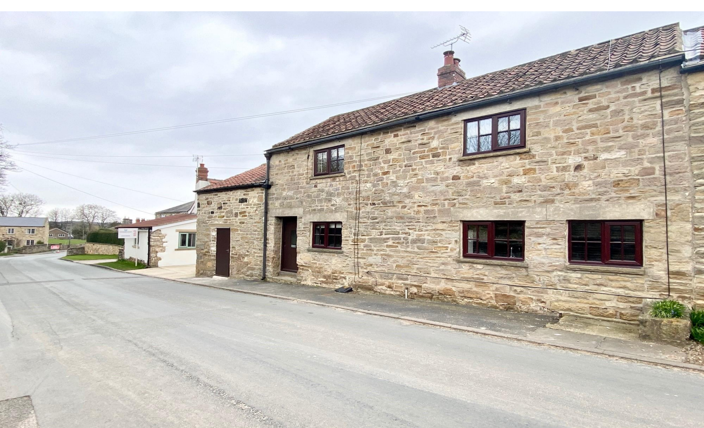
Beaully Cottage Knarsborough