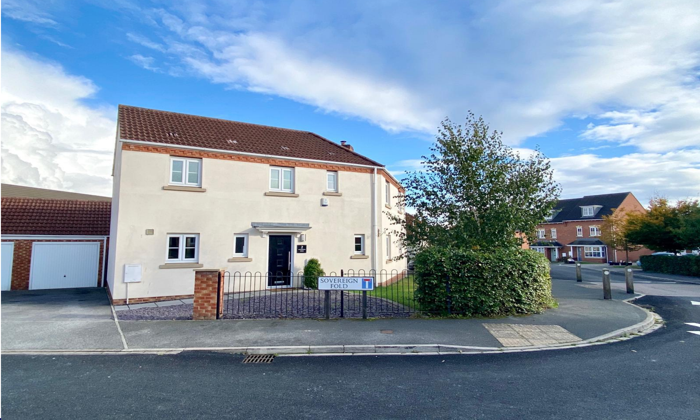
2 Sovereign Fold Knaresborough