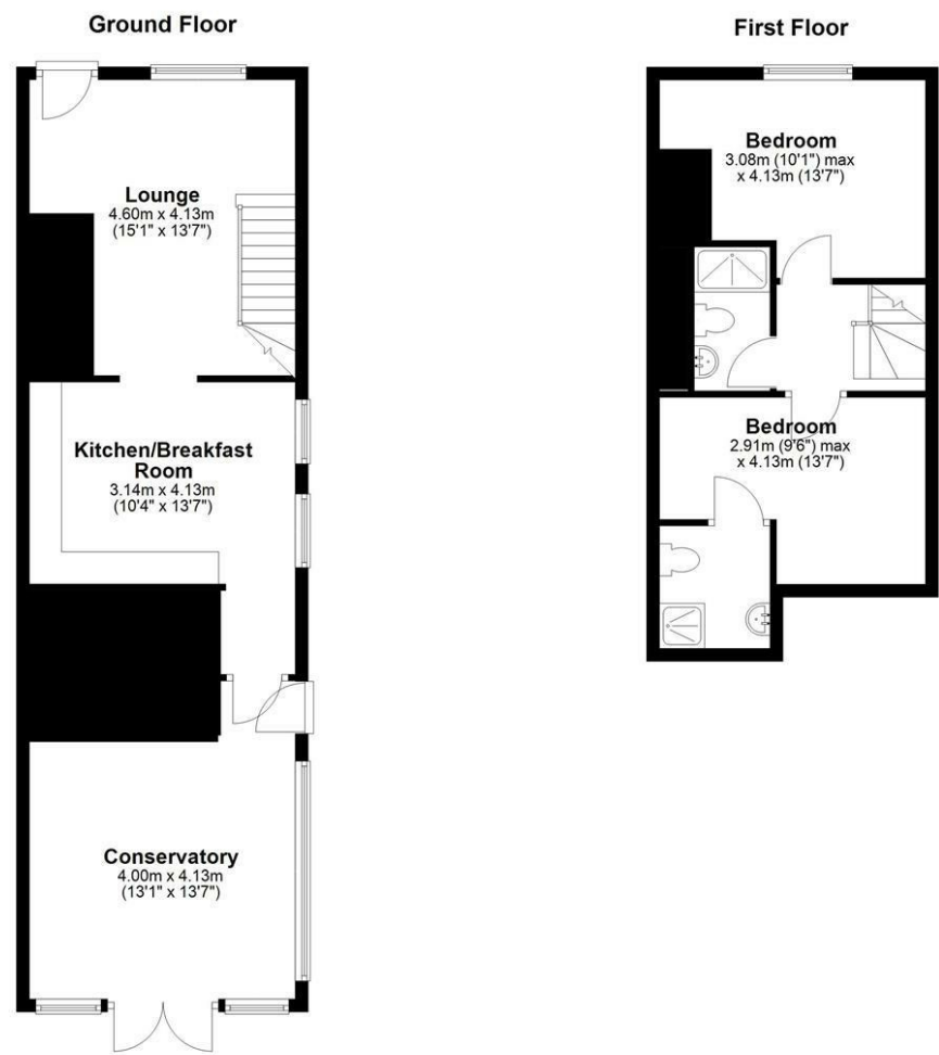
Artists impression, for illustration purposes only. All measurements are approximate. Not to Scale. Direct Dial 07973 205 007 Plan produced using PlanUp.