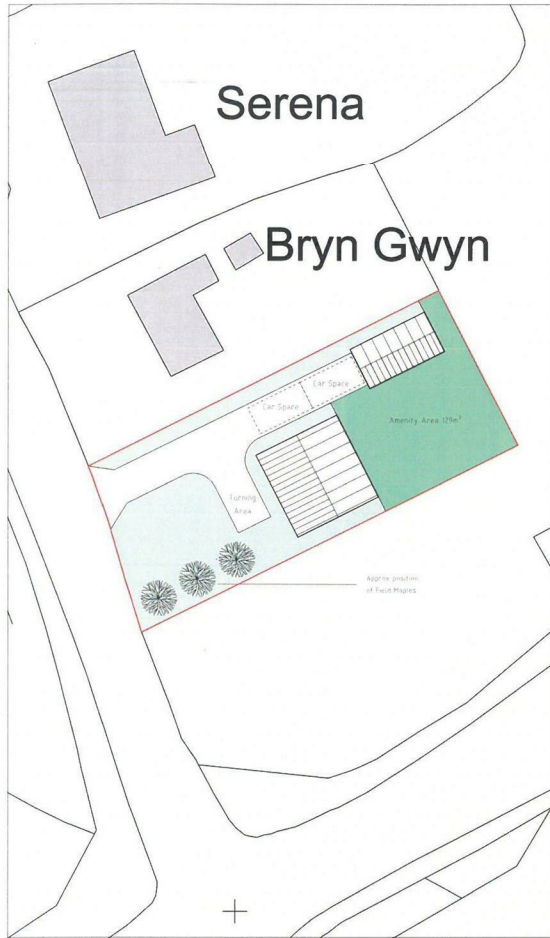
Site Plan 1:200