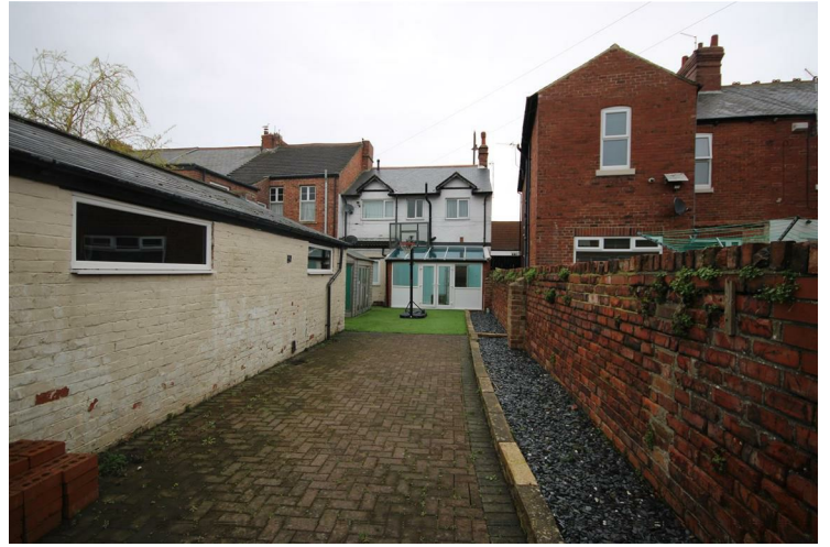
An enclosed, large, low maintenance courtyard garden is located to the rear of this spacious home offering astro turf and a patio area providing a safe and secure environment for family living. There is also a garden shed, brick store/garage and double gates which offer access for off street parking.