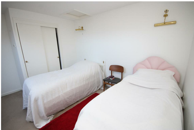
Natural light floods this spacious double bedroom from a Velux roof light. Built-in wardrobe provide hanging and storage space.