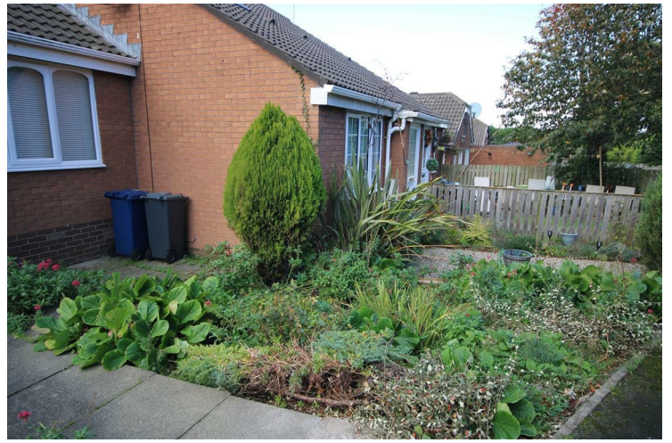
This delightful home has the benefit of a well stocked garden to the front with paved patio ideal for relaxing on a summer day.