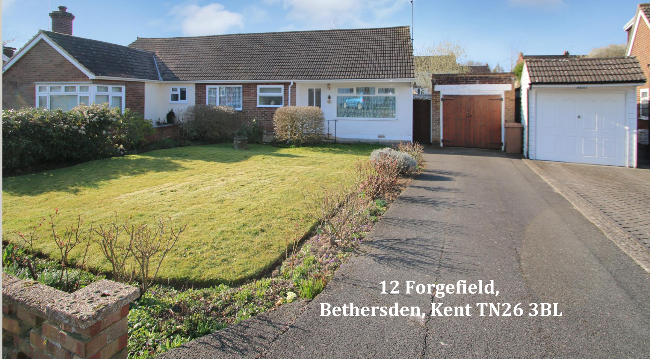
12 Forgefield, Bethersden, Kent TN26 3BL