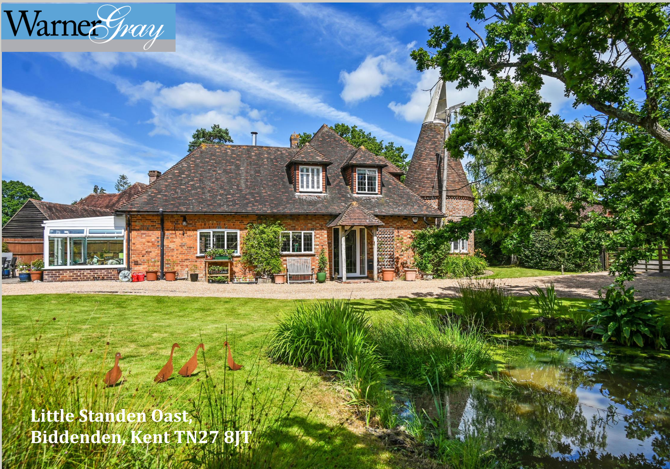
Little Standen Oast, Biddenden, Kent TN27 8JT