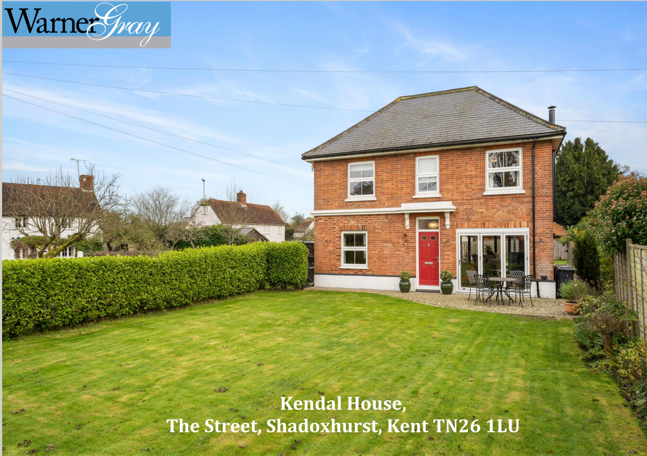
Kendal House, The Street, Shadoxhurst, Kent TN26 1LU