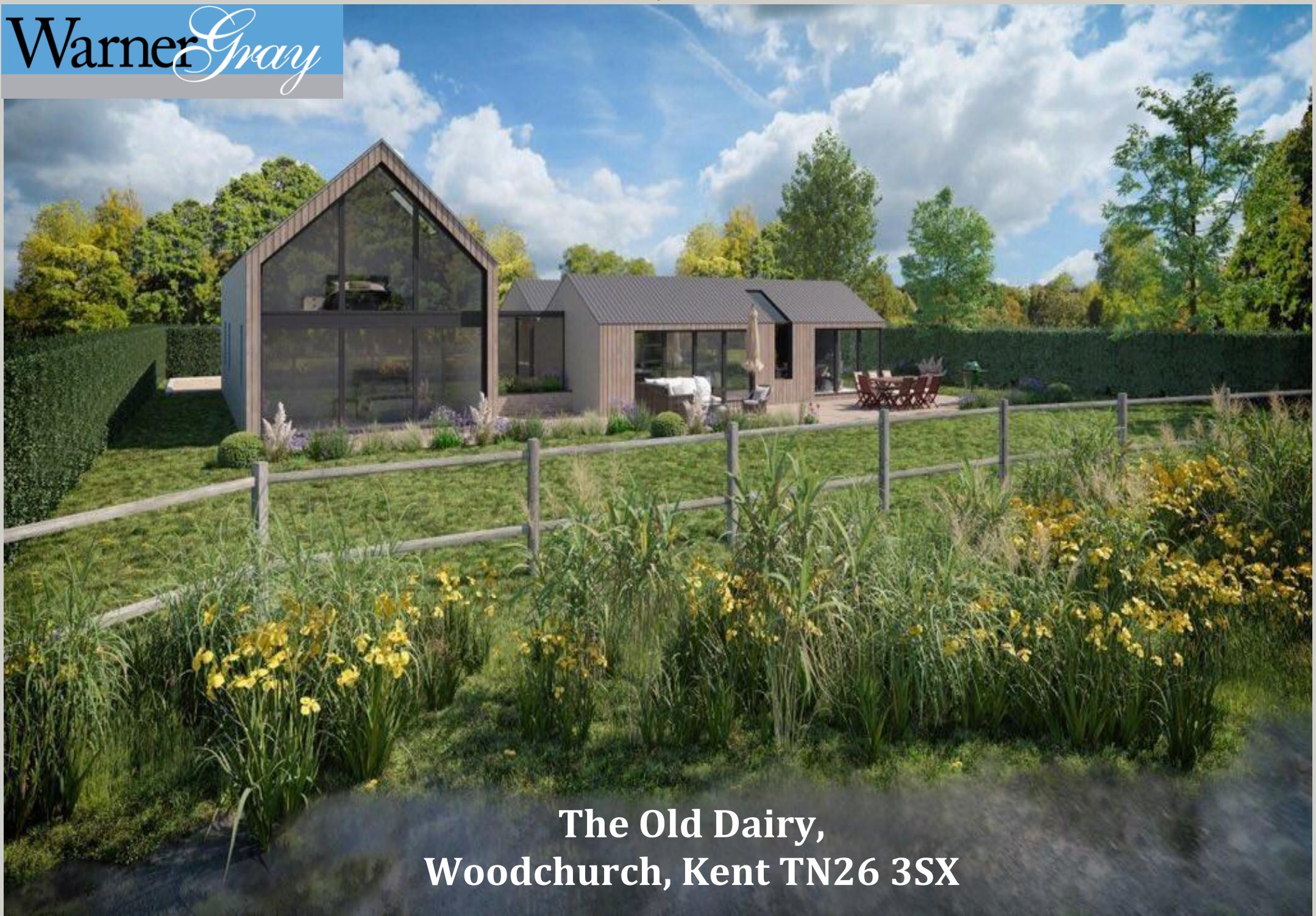
The Old Dairy, Woodchurch, Kent TN26 3SX