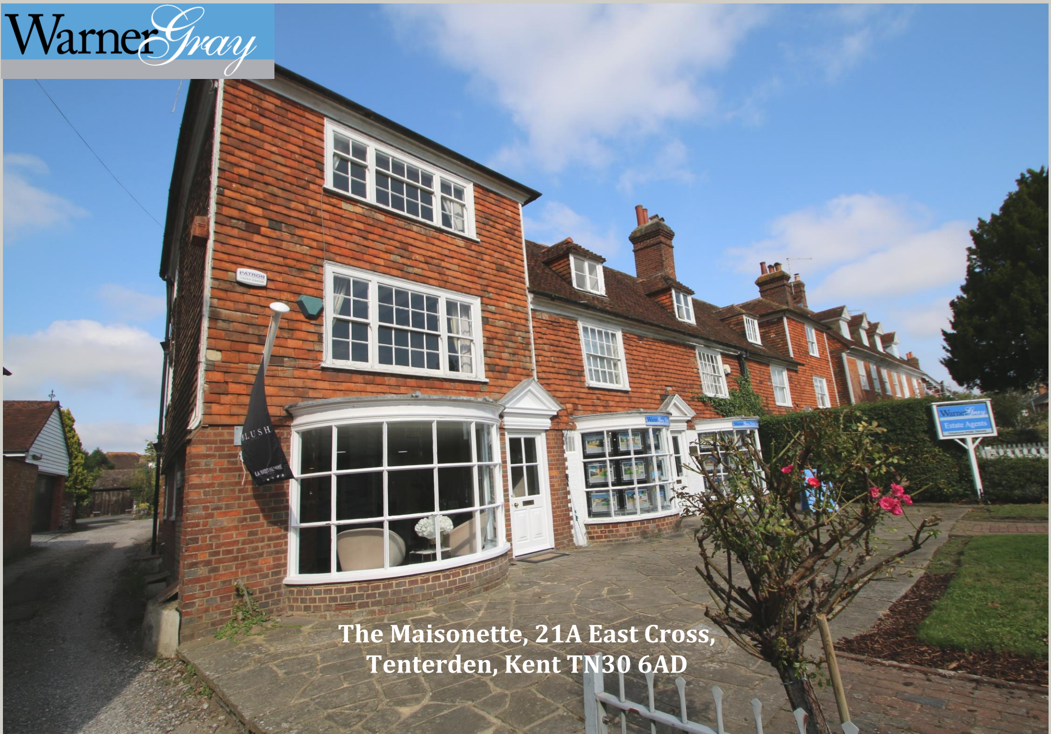
The Maisonette, 21A East Cross, Tenterden, Kent TN30 6AD