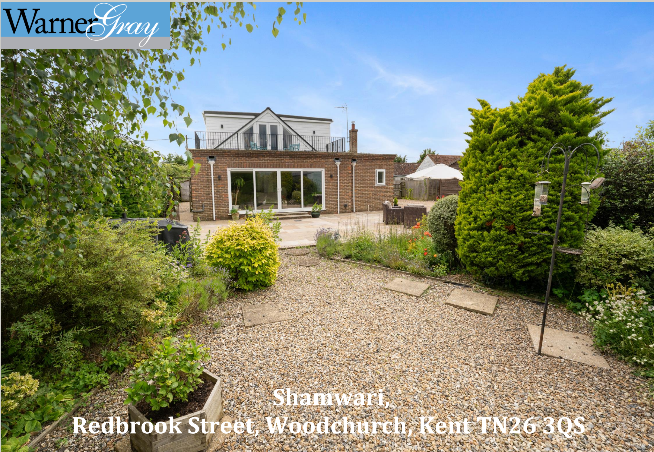
Shamwari, Redbrook Street, Woodchurch, Kent TN26 3QS