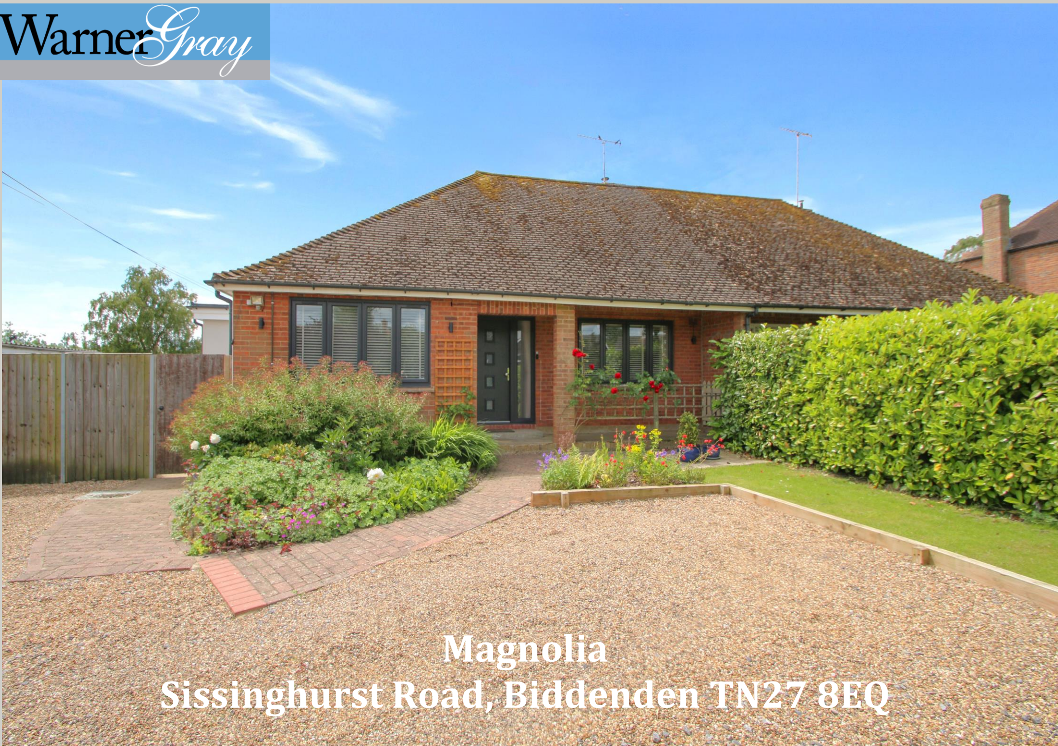
Magnolia Sissinghurst Road, Biddenden TN27 8EQ