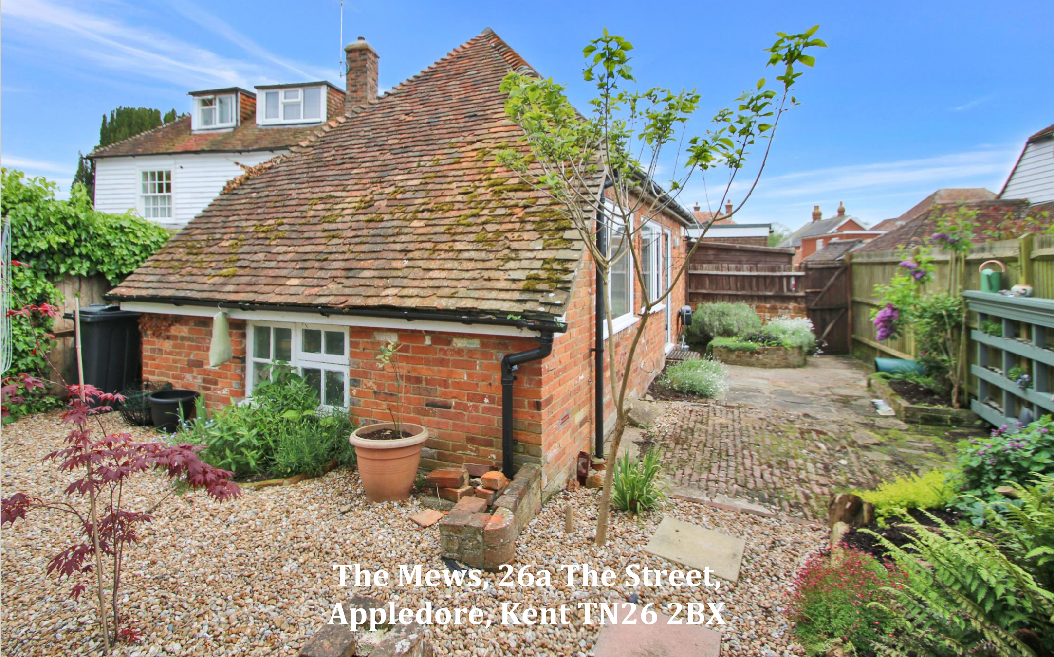
The Mews, 26a The Street, Appledore, Kent TN26 2BX