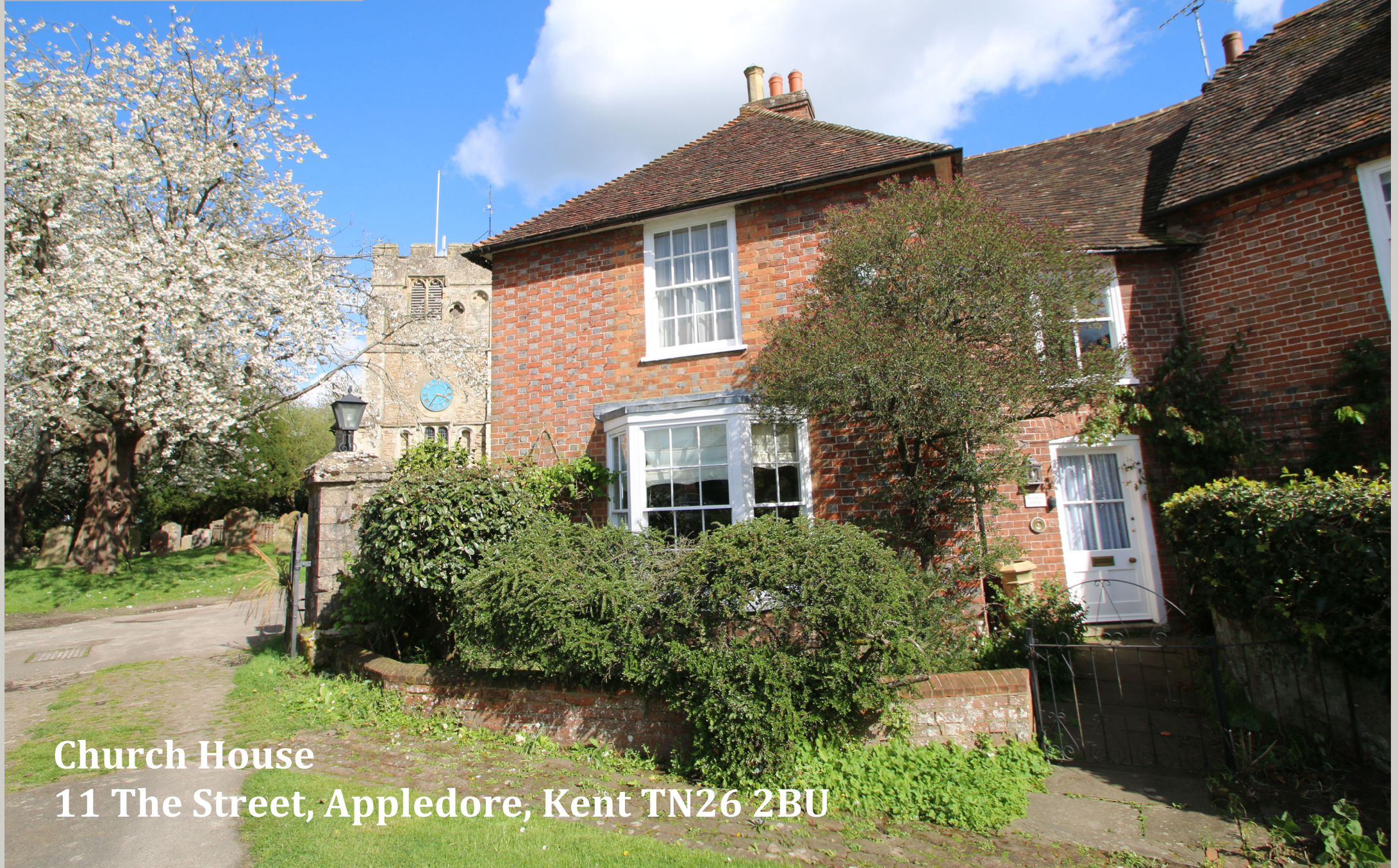
Church House 11 The Street, Appledore, Kent TN26 2BU