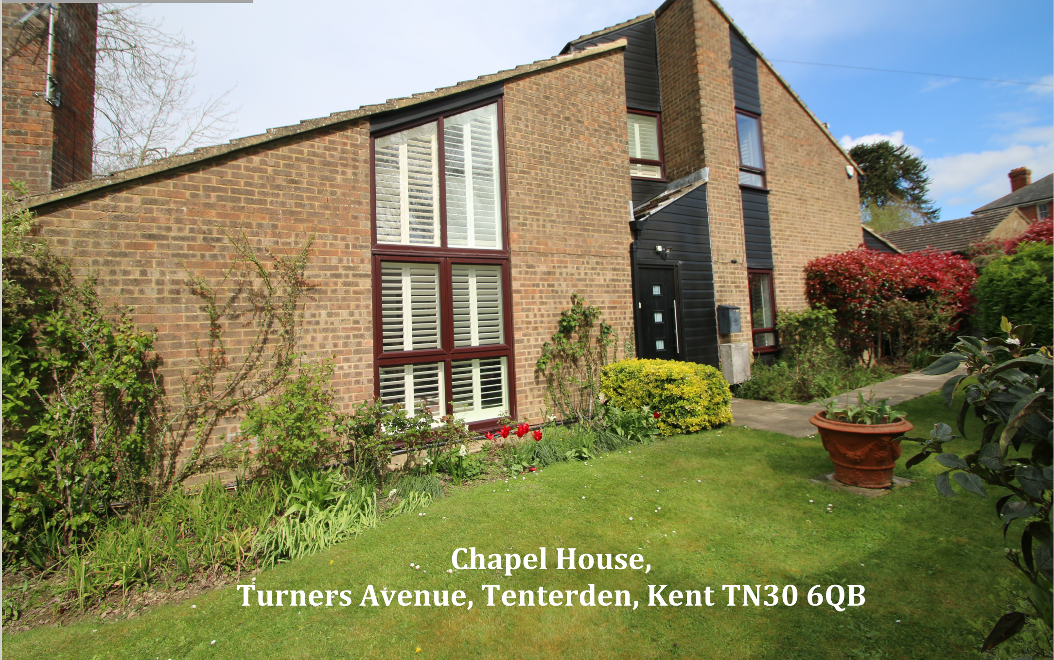
Chapel House, Turners Avenue, Tenterden, Kent TN30 6QB