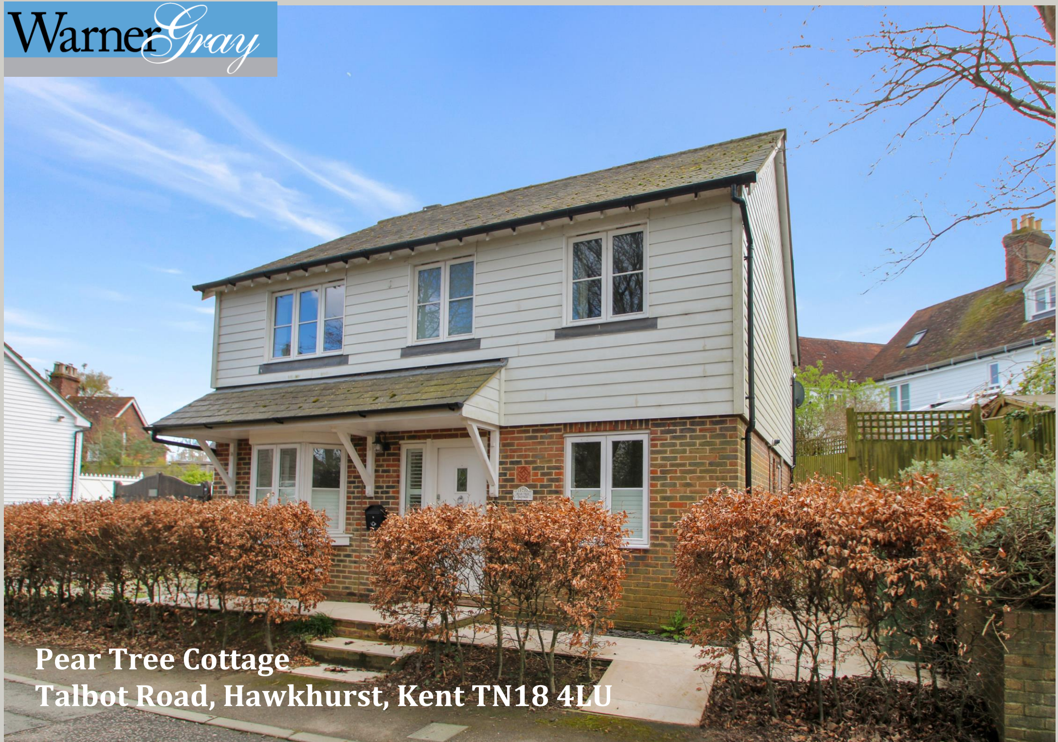
Pear Tree Cottage Talbot Road, Hawkhurst, Kent TN18 4LU