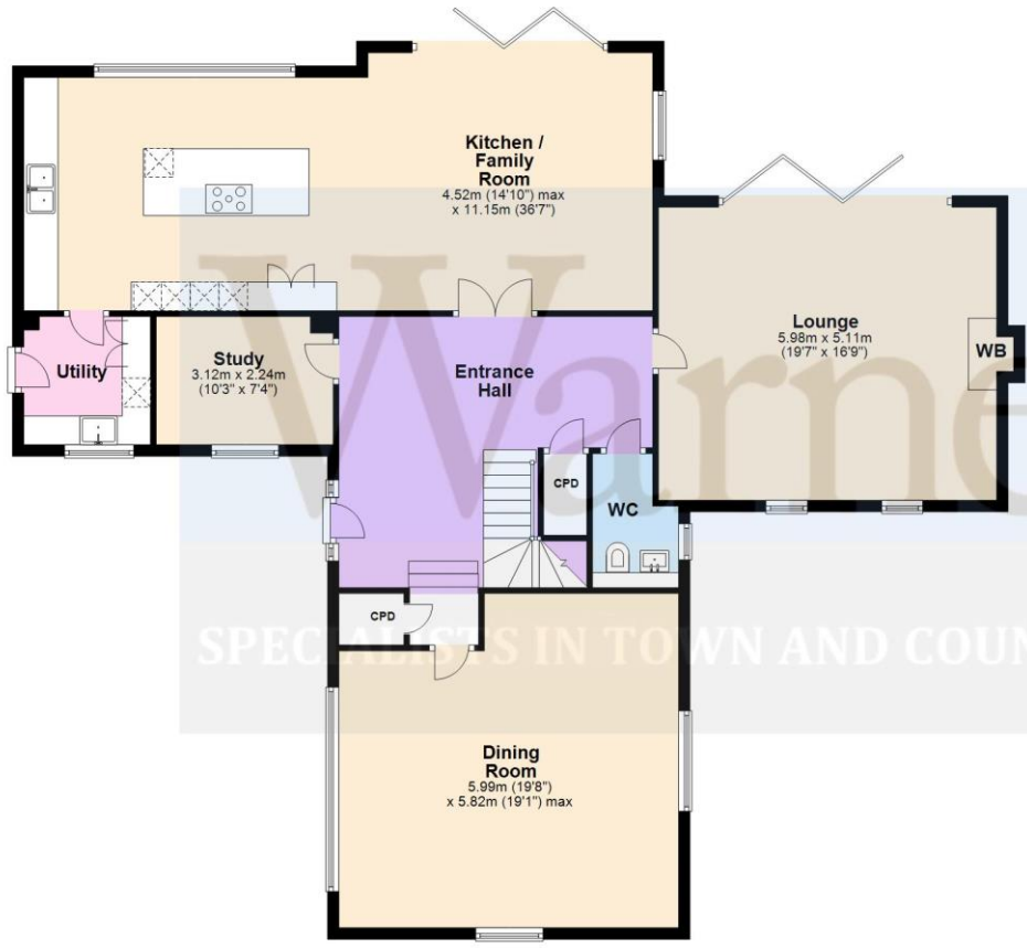
Ground Floor Approx. 154.3 sq. metres (1661.2 sq. feet)