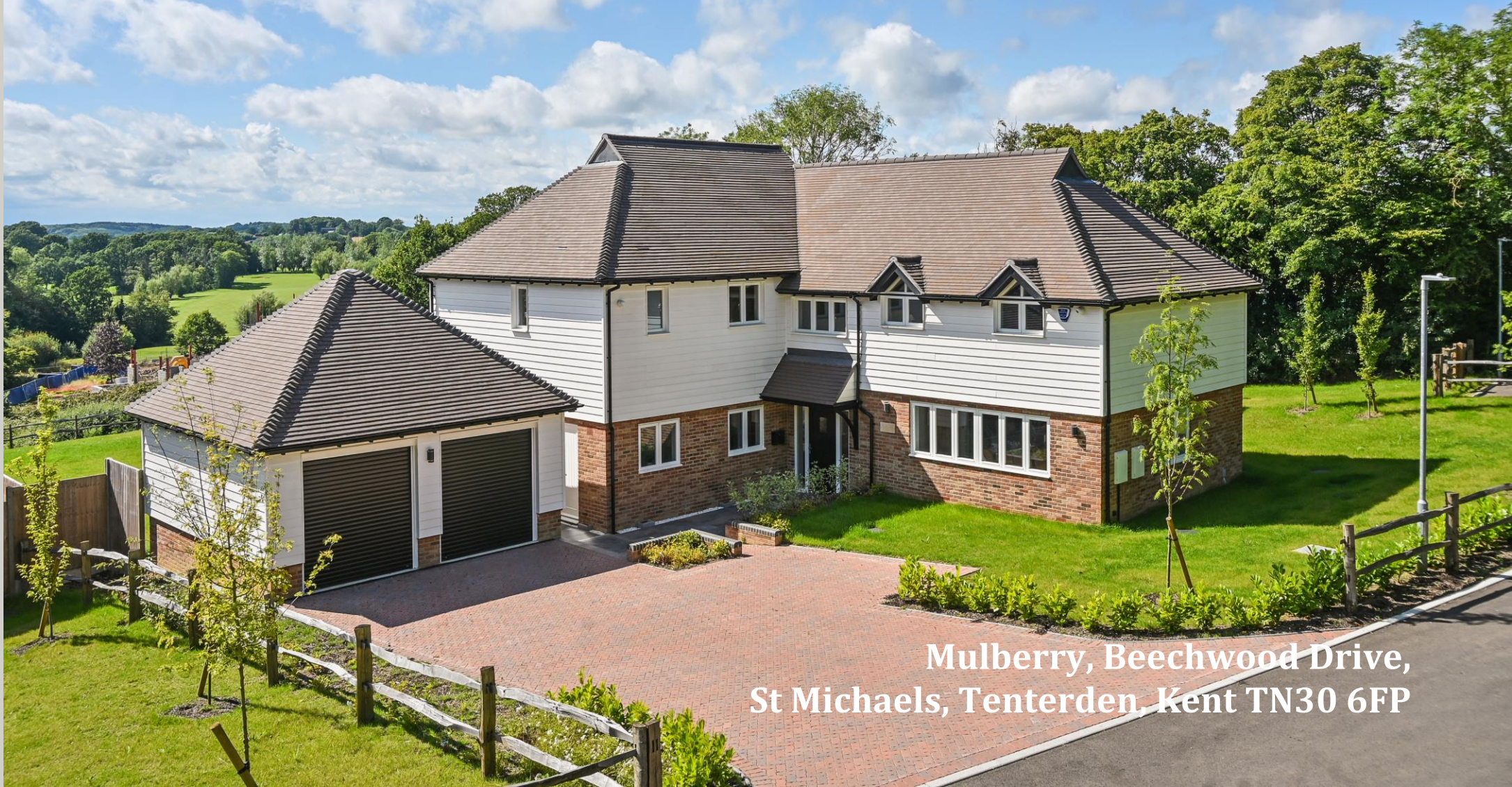
Mulberry, Beechwood Drive, St Michaels, Tenterden, Kent TN30 6FP