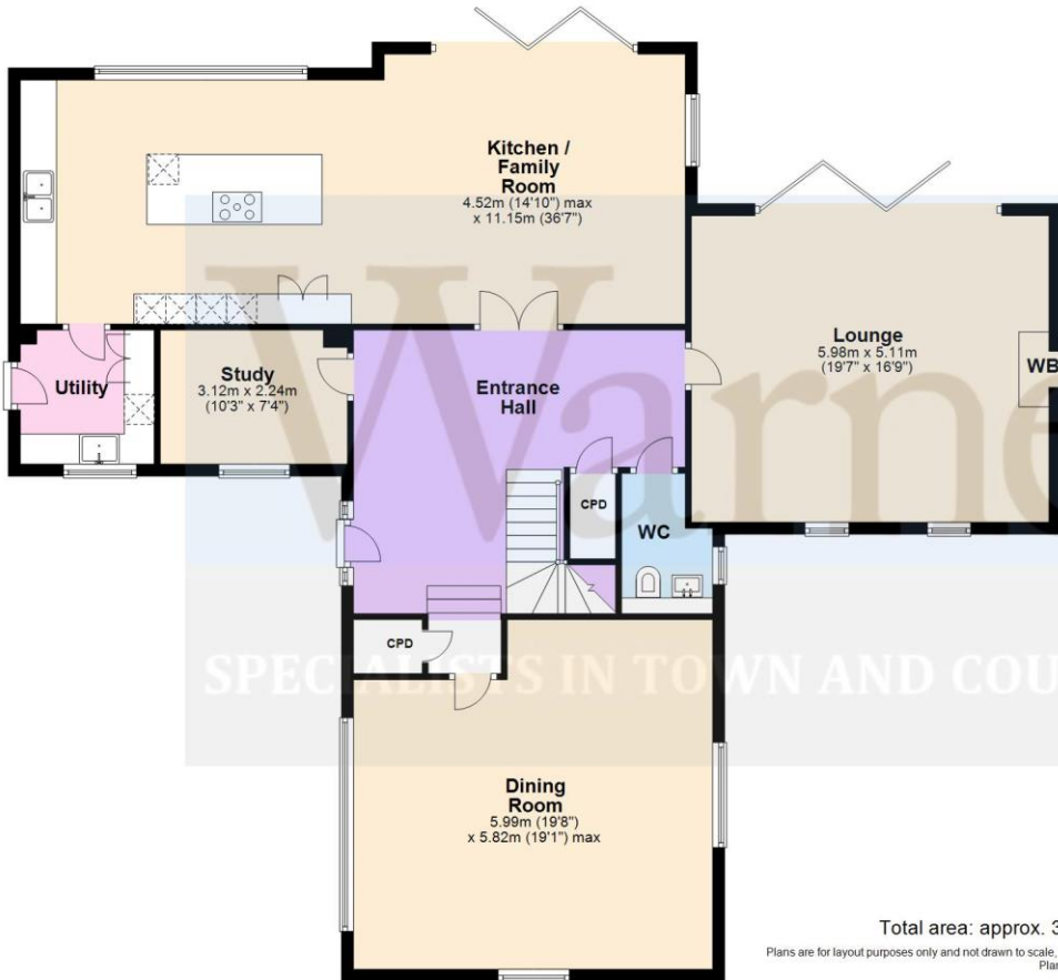
Ground Floor Approx. 154.3 sq. metres (1661.2 sq. feet)