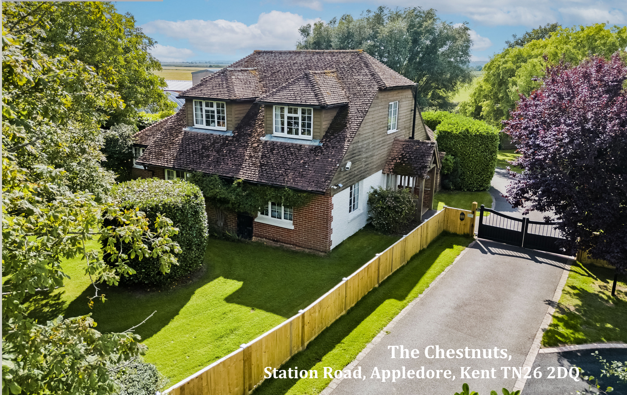
The Chestnuts, Station Road, Appledore, Kent TN26 2DQ