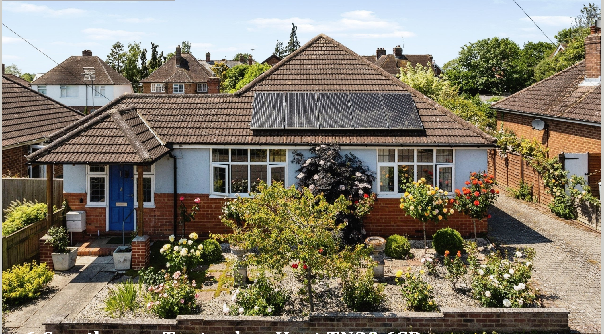
6 Craythorne, Tenterden, Kent TN30 6SD