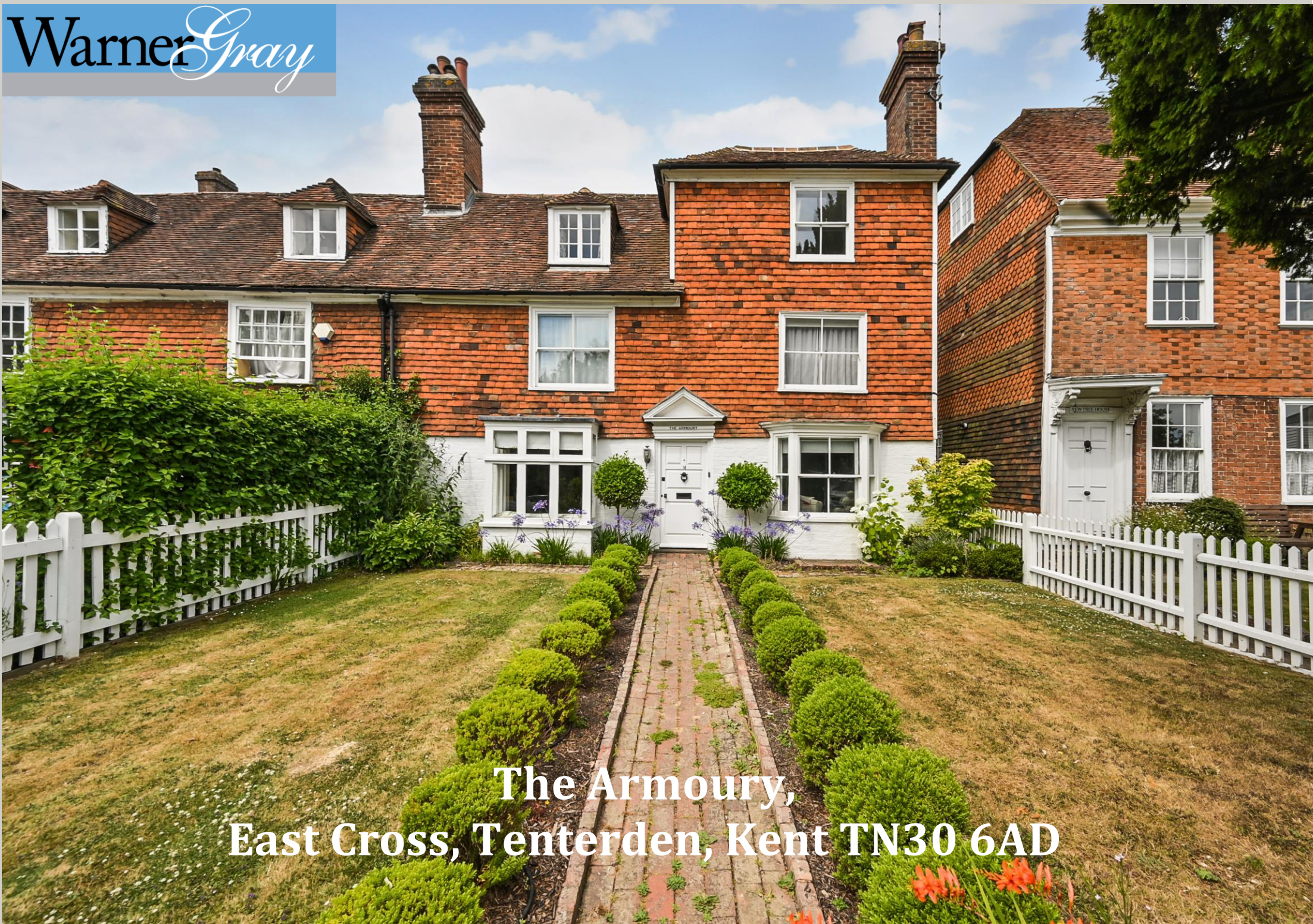
The Armoury, East Cross, Tenterden, Kent TN30 6AD