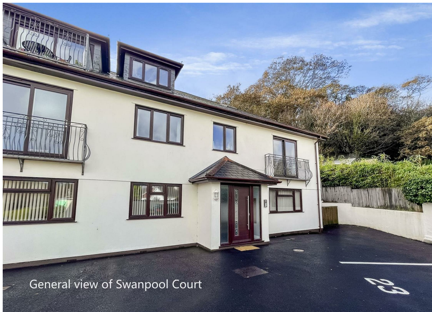
General view of Swanpool Court