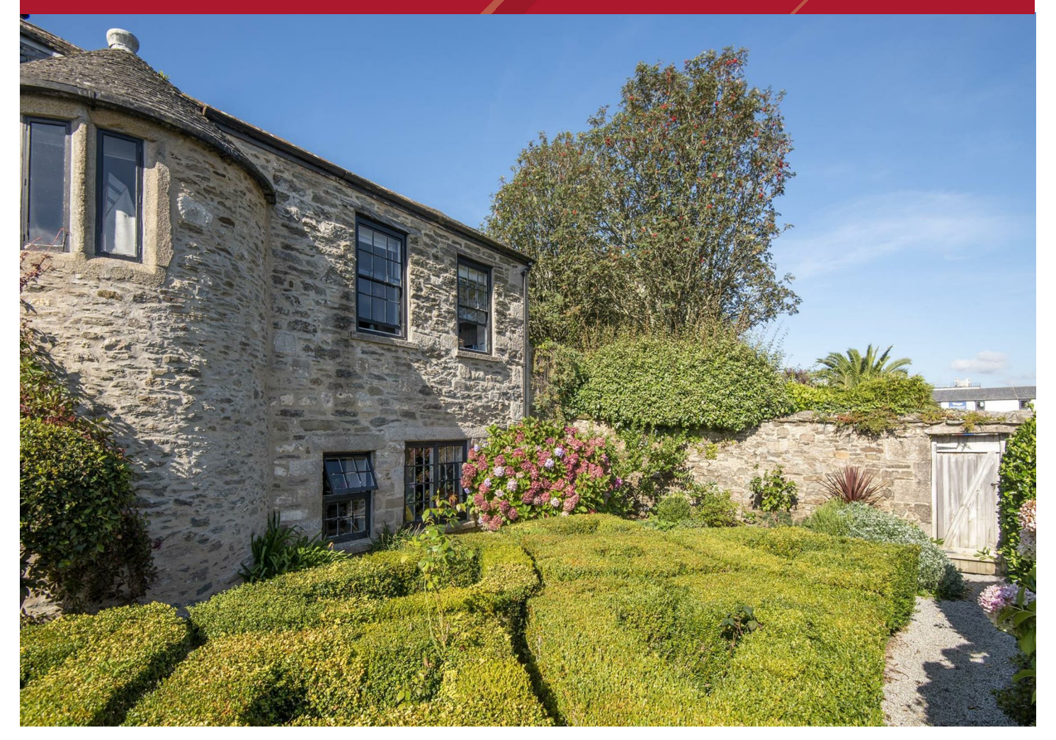
4 Arwenack House, Grove Place, Falmouth, TR11 4AU £269,950

On the instructions of the executors: an extremely rare opportunity to acquire a small 'bijou' wing of this historic former manor house, occupying an incredibly convenient, yet surprisingly well hidden location, a 'stones throw' from Events Square and the harbourside, with Falmouth's excellent range of amenities all within easy walking distance. The 2 storey accommodation would benefit from some updating but has much charm and character and already benefits from gas central heating, a private terrace, use of the beautifully stocked and sunny grounds, as well as allocated parking in addition to open-fronted garaging. Being offered for sale with immediate vacant possession and no onward chain - an early viewing is unhesitatingly recommended.