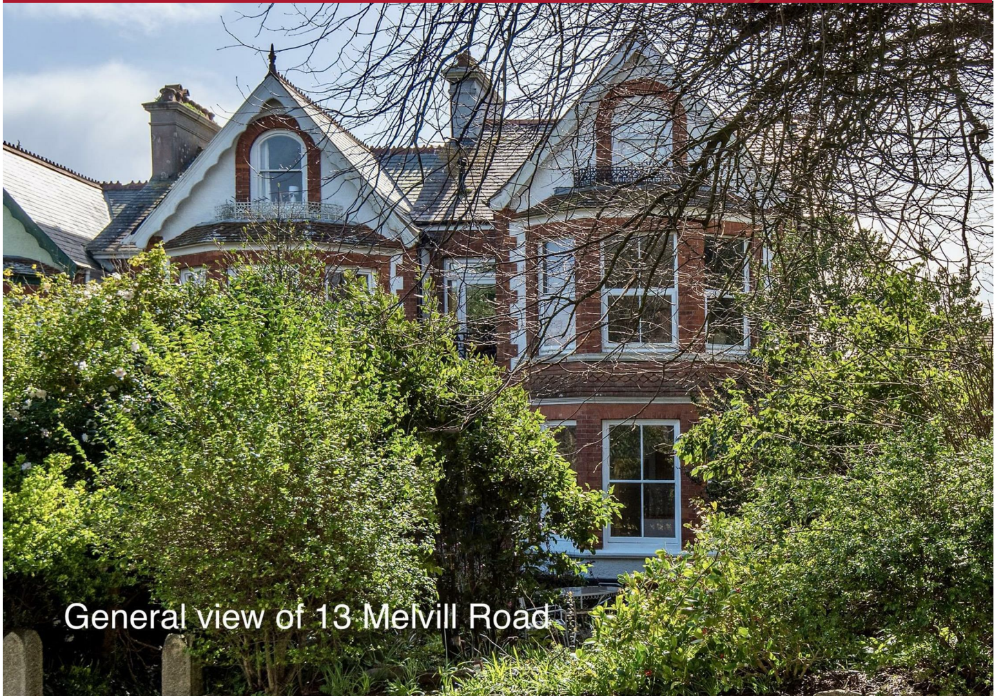
General view of 13 Melvill Road