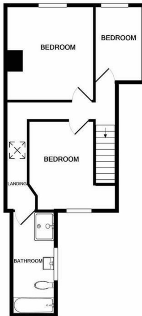
1ST FLOOR APPROX. FLOOR AREA 461 SQ.FT. (42.9 SQ.M.)

TOTAL APPROX. FLOOR AREA 1020 SQ.FT. (94.7 SQ.M.)