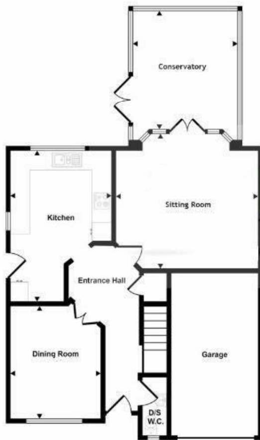
Ground Floor Approx 77 sq m / 833 sq ft

Approx Gross Internal Area 140 sq m / 1503 sq ft