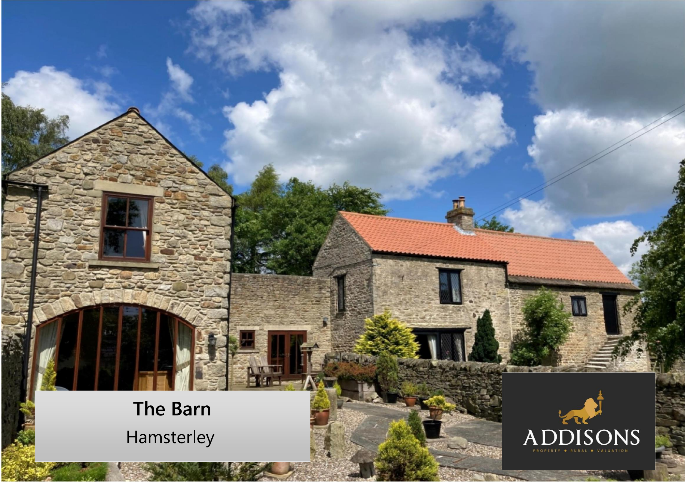
The Barn Hamsterley