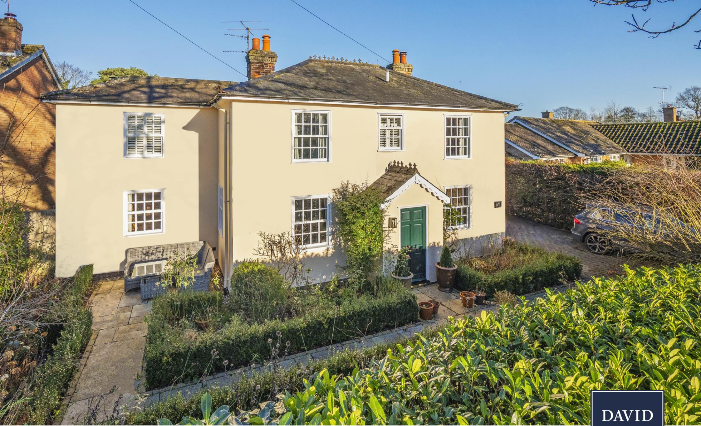
Oak House Great Horkesley, Essex