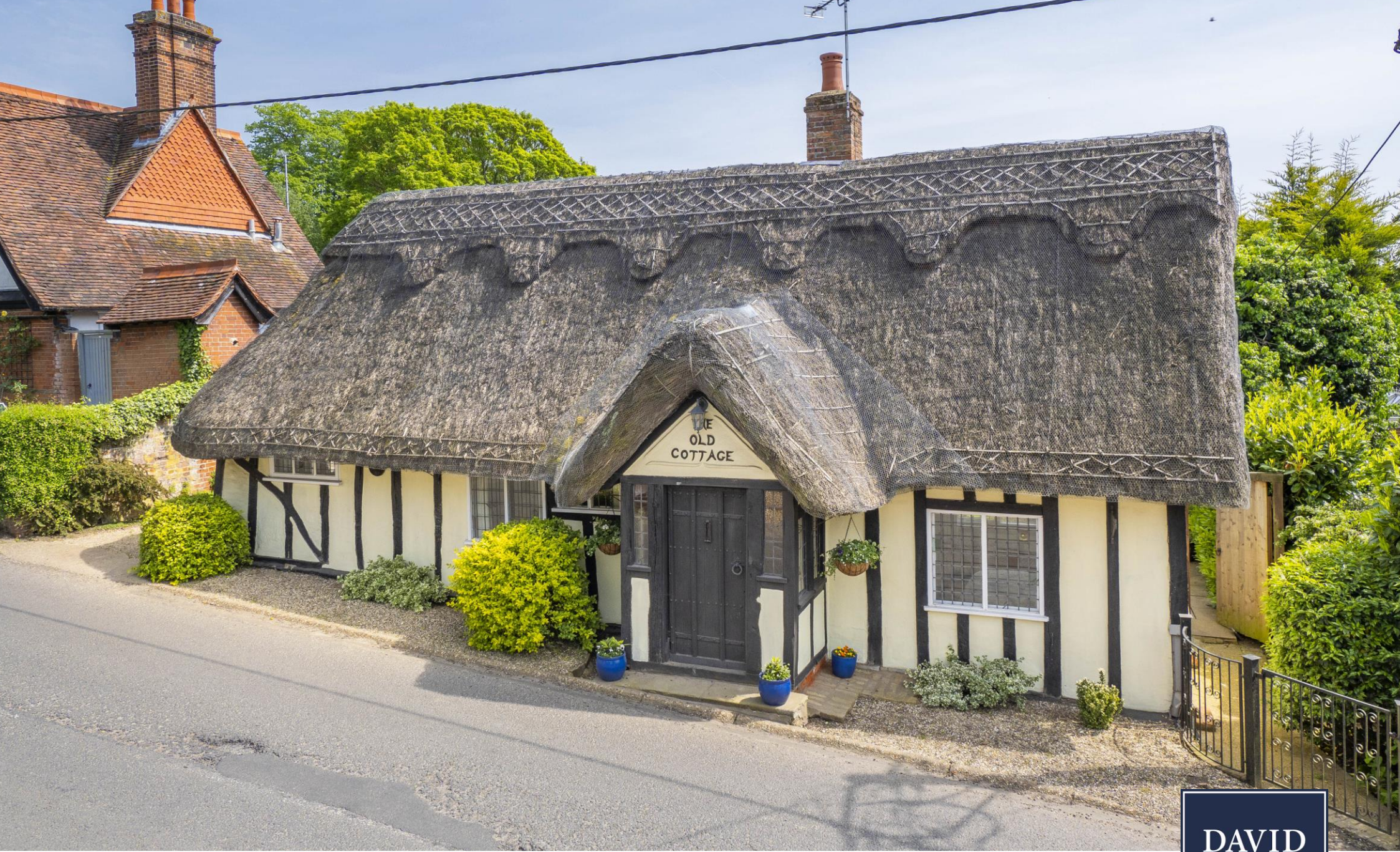
The Old Cottage Lower Street, Higham, Colchester