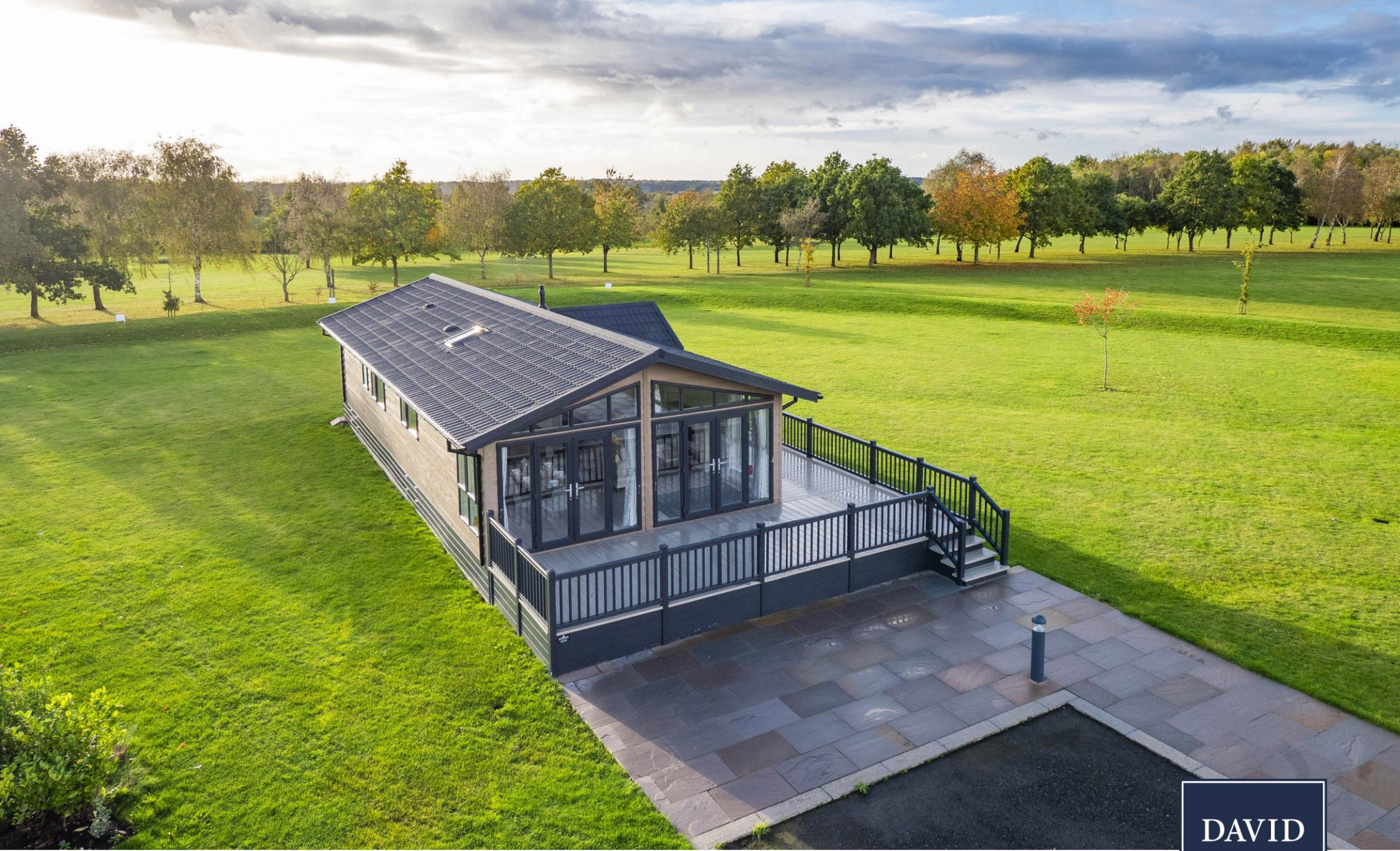
Lodge 7, Brett Vale Golf Club Raydon, Suffolk