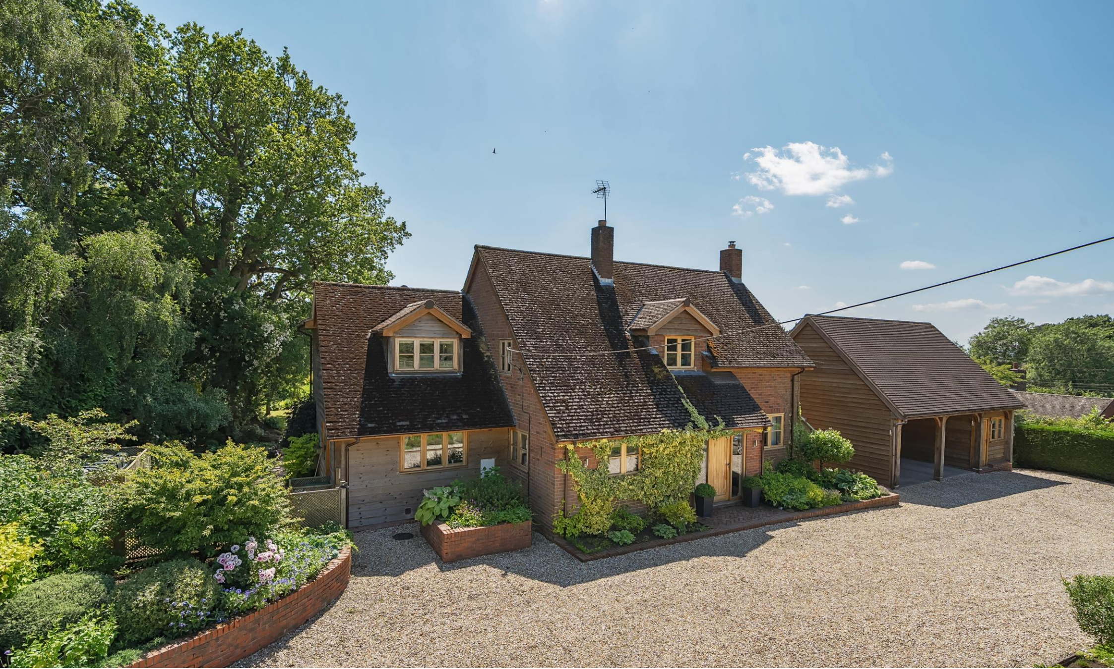
Oakfield House, Menith Wood, Worcestershire