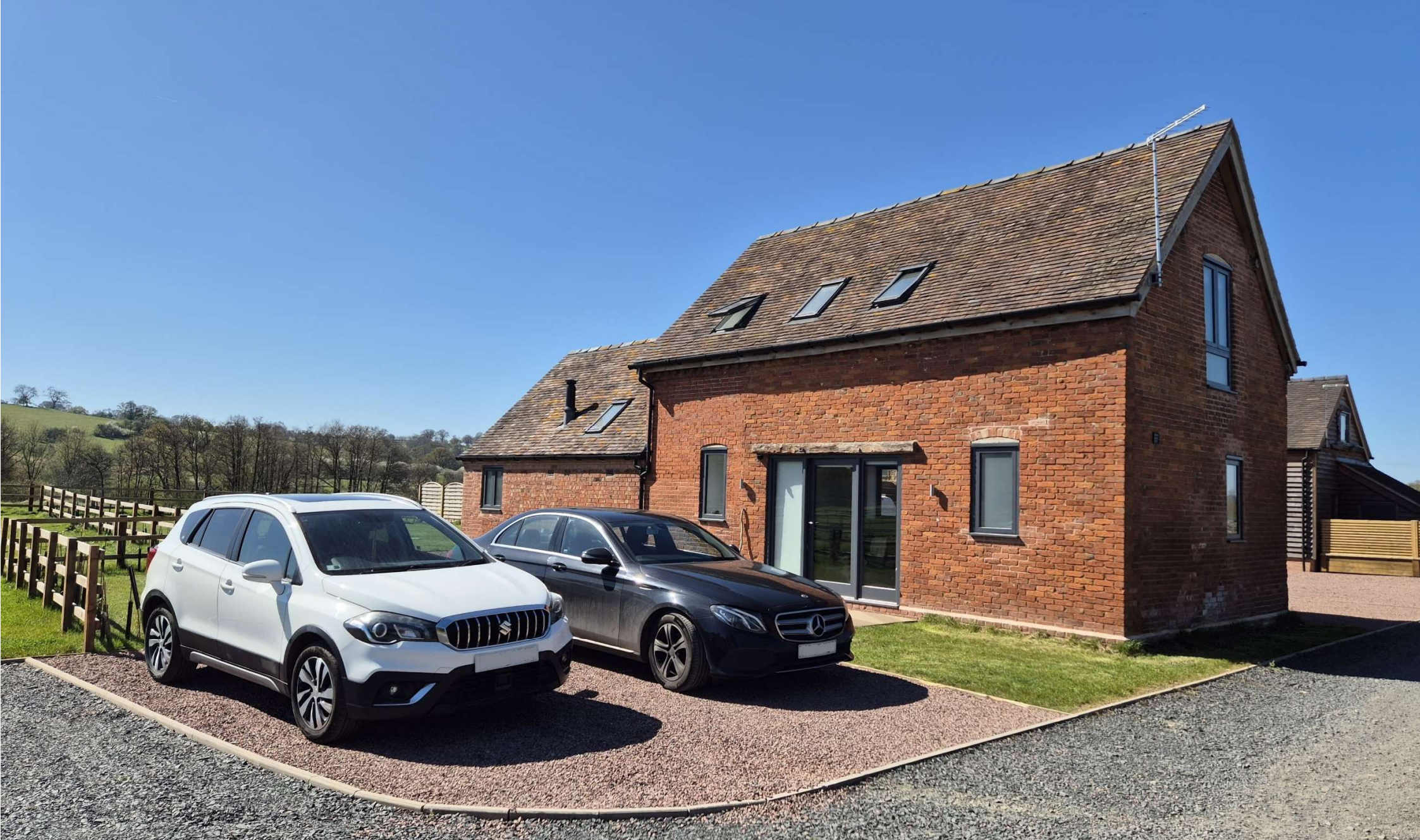
Dairy Barn (Barn 3), Cinders Farm, Tenbury Wells