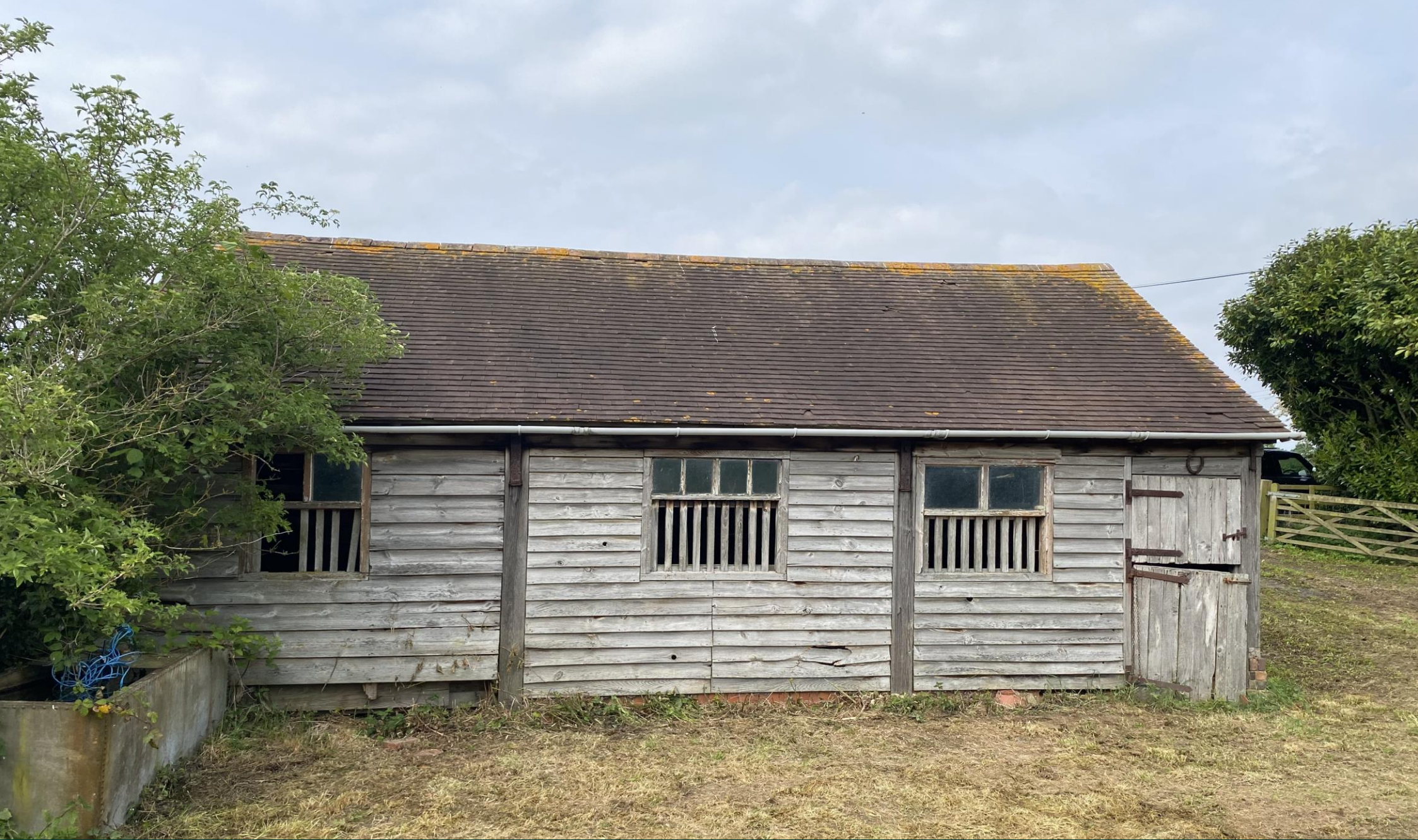
Spring Barn, Bridgnorth, Shropshire