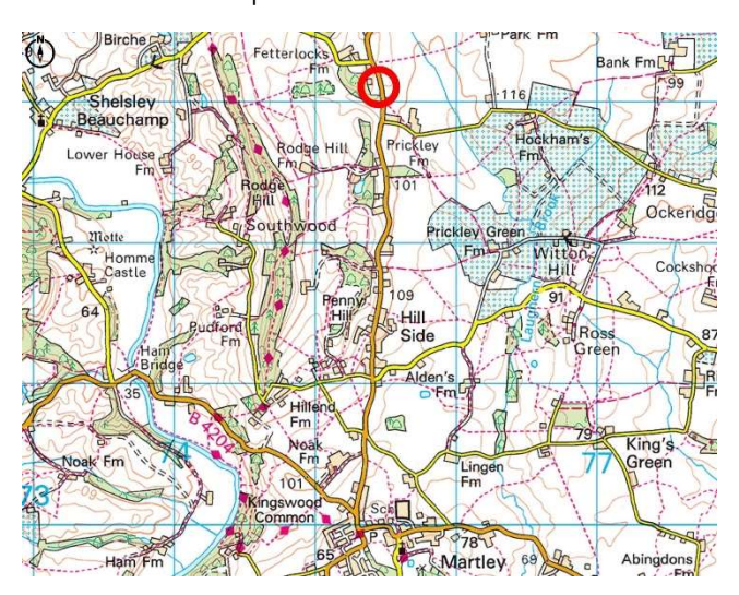
What 3 Words: approvals.gladiators.novelists

SITUATION The land is situated between the villages of Martley and Great Witley. Taking the B4197, from Great Witley to Martley the land is on your right-hand side after approximately 2 ½ miles from the village of Great Witley, as indicated by our 'For Sale' board. The land is approximately 9 miles west of Worcester and 31 miles from Birmingham. A location plan is enclosed, along with a land plan, to the rear of these particulars.